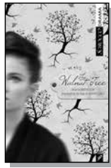
The Walnut Tree Geoffrey Ursell