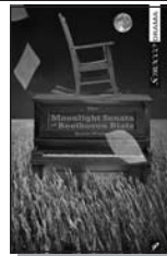
The Moonlight Sonata of Beethoven Blatz Armin Wiebe