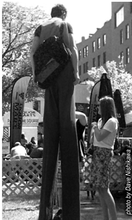
Ross Vegas towers in Old Market Square.