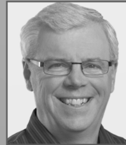
Greg Selinger MLA for St. Boniface Premier of Manitoba 204-237-9247 GregSelinger.ca