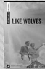
Like Wolves Rosa Laborde