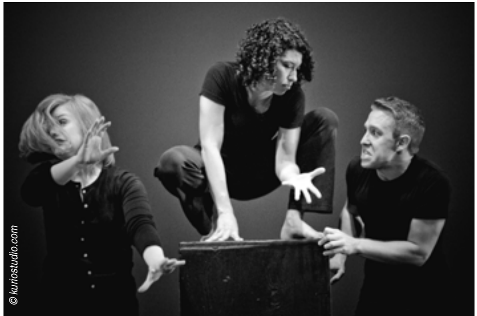
Hot Thespian Action speak in tongues and numerous other body parts in Fringe hit Body Language.

Her show is divided into four segments—the first three dealing with the deaths of her three “mothers”, several years apart, and the final one is an epilogue of satisfying reconciliation.